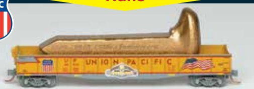
Union Pacific Golden Spike 150th Anniversary Gondola with Spike