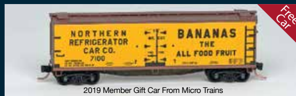
2019 Member Gift Car From Micro Trains