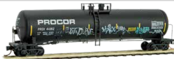
N Procor #110 44 300...$36.95