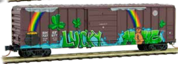
N 'Lucky' Graffiti 2-pack #993 05 380...$59.95