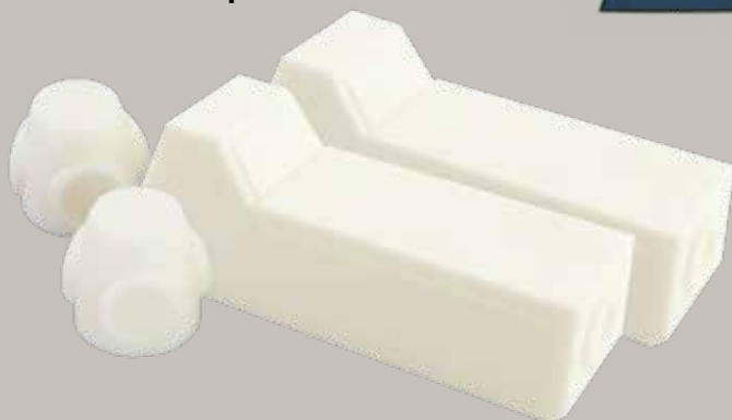
N Hub & New Generator 4-pack #499 43 934...$13.95