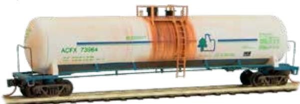
N ACFX #110 44 290...$36.20