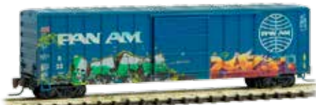
Z Pan Am #510 44 110...$31.90