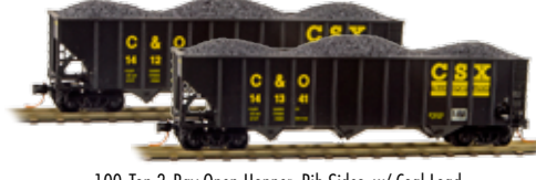
100-Ton 3-Bay Open Hopper, Rib Sides, w/ Coal Load CSX/C&O® • Rd#141271/141341 Item#108 00 301...$25.30 • Item#108 00 302...$25.30