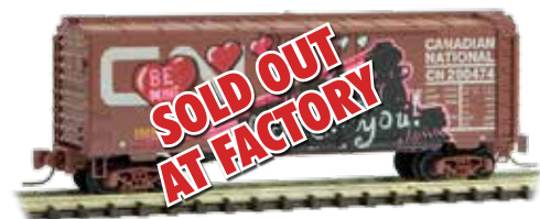
Z CN 'Valentine' #502 44 280...$27.90