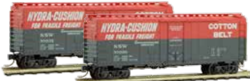
40' Standard Box Car, Plug Door SLSW Cotton Belt® • Rd #30032/30038 Item#021 00 591...$30.90 • Item#021 00 592...$30.90