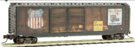
N Union Pacific® #034 44 090...$27.75