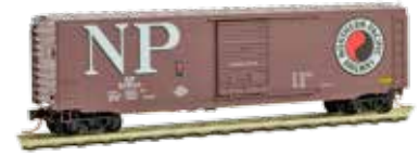
50' Standard Box Car, Single Door, w/o Roofwalk Northern Pacific • Rd#31500 Item#077 00 270...$26.90