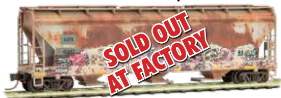
N ACFX 'Valentine' #094 44 470...$33.90