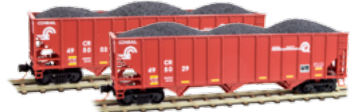
100-Ton 3-Bay Open Hopper, Rib Sides, w/ Coal Load Conrail • Rd#495003/495029 Item#108 00 321...$25.30 • Item#108 00 322...$25.30