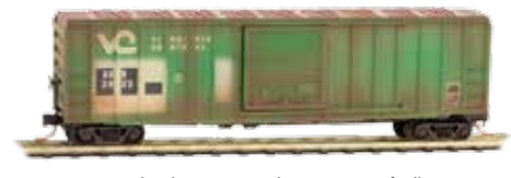
50' Rib Side Box Car, Single Door, w/o Roofwalk Weathered Alabama & GC/VC • Rd#2922 Item#025 44 850...$27.40