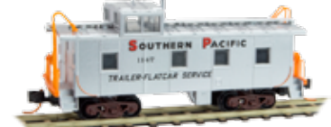
36' Riveted Steel Caboose, Offset Cupola Southern Pacific® • Rd#1096 Item#100 00 320...$30.95