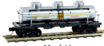
3-Dome Tank Car Shell/Navy Gas • Rd#8511 Item#066 00 080...$29.95