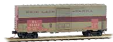
40' Standard Box Car, Single Door, w/o Roofwalk Weathered Erie Lackawanna • Rd#50462 Item#024 44 390...$29.95