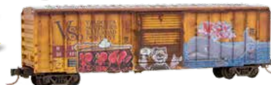
N Hartford and Slocomb 3-pack #993 05 370...$94.95