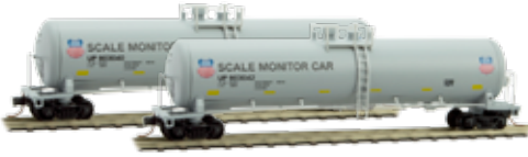
56' General Service Tank Car Union Pacific® • Rd#903040/903042 Item#110 00 251...$35.90 • Item#110 00 252...$35.90