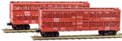
40' Despatch Stock Car Baltimore & Ohio® • Rd#11110/11116 Item#035 00 241...$19.90 • Item#035 00 242...$19.90