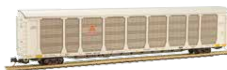
89' Tri-Level Closed Autorack Kansas City Southern • Rd#300148 Item#111 00 200...$44.95