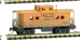
Z DRGW® Weathered Train Set includes F7, stock car, gondola, hopper, 50' boxcar & caboose #994 05 150...$234.95