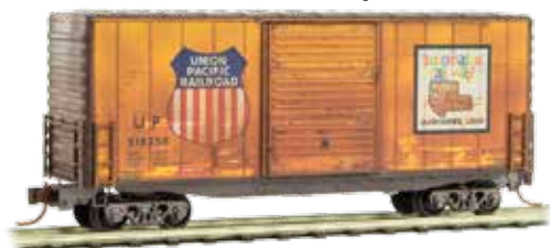
N Union Pacific® #101 44 040...$36.90