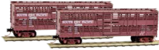
40' Despatch Stock Car Southern Pacific® • Rd#73458/73464 Item#035 00 251...$19.90 • Item#035 00 252...$19.90