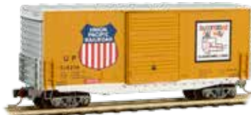
40' Hy-Cube Box Car, Single Door Union Pacific® • Rd#518256 Item#101 00 040...$35.90