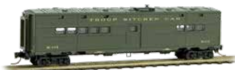
Kitchen Car #118 00 010...Rd#K-115...$24.95