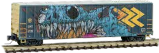
Z Ontario Northland 'Monster #1' #511 44 261...$32.95