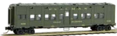
Sleeper Car #116 00 011...Rd#9026...$24.95