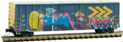
Z Ontario Northland 'Monster #2' #511 44 262...$32.95