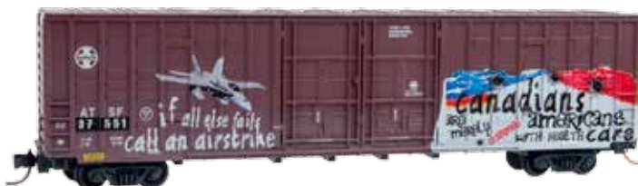
Car #5 ATSF 37551 - "Canadians are merely unarmed Americans with healthcare"