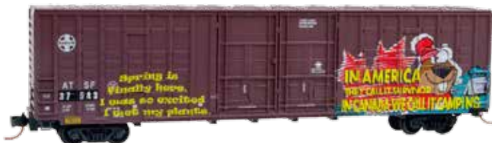
Car #4 ATSF 37543 - "In America they call it Survivor... In Canada we call it Camping"