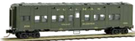
Sleeper Car #116 00 012...Rd#9334...$24.95