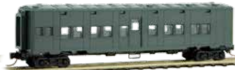
Undec Troop Sleeper #116 00 000...$17.30

*All undecorated bodystyles come unassembled.