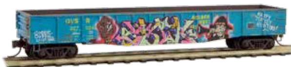
N Golden West Service 'Turkey' #105 44 131...$26.95