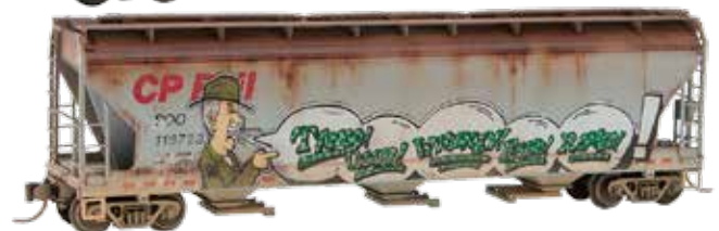
N Soo/CP 2-pack #094 44 092...$64.95