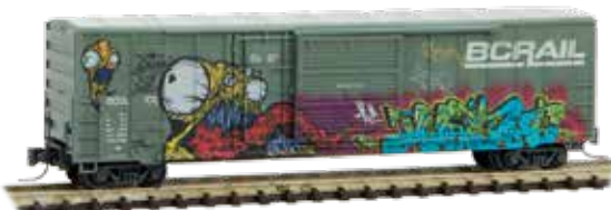
Z BCR 'Monster #3' #512 44 030...$29.95