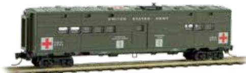
Hospital Car #118 00 050...Rd#8731...$28.90