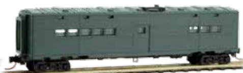
Undec Kitchen Car #118 00 000...$17.30