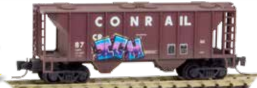
Z Conrail #531 44 240...$26.90