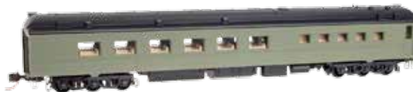
N Painted Under Business Car (Pullman Green)