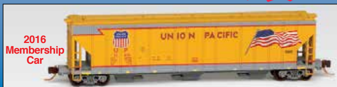
2016 Membership Car