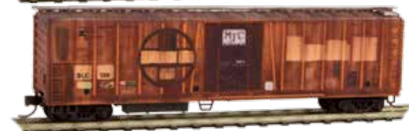
N San Luis Central 2-pack #070 44 080...$59.95