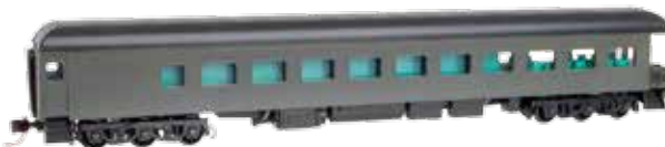
N Painted Under Diner Car (Pullman Green)