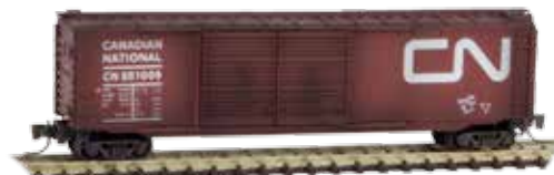
Z Canadian National w/hobo tagging #506 44 280...$26.90