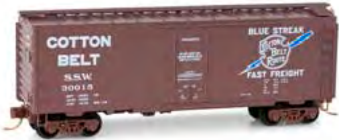
Cotton Belt® and SSW® are registered trademarks of the Union Pacific Railroad. #021 00 550...$18.80

This 40' standard box car with plug door is painted brown with white and blue SSW Cotton Belt Route 'Blue Streak' logo and white lettering. This representative of series 30000-30024 was built in January 1958 by Pacific Car & Foundry and runs the Southwestern Districton Roller Bearing trucks. Cars in this series are equipped with Pullman-Standard Compartmentizer gates and fixtures. In recent years Cotton Belt has been essentially a division of the Southern Pacific though its equipment is still lettered 'Cotton Belt.'