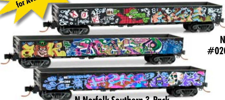
N Norfolk Southern 3-Pack #993 05 140...$99.95

Contact Your Local Dealer for Availability!