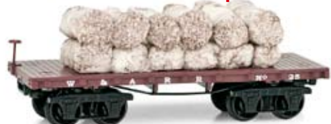
Flat #153 00 020...$16.90