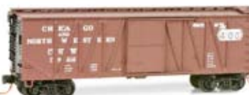
40' Outside Braced Box Car, Plug Door Chicago & North Western • Rd# 78212 Item# 028 00 190...$21.85