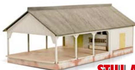
Civil War Era Store House Kit #499 90 944...$31.95