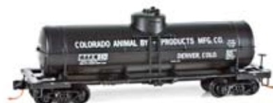
39' Single Dome Tank Car Colorado Animal By-Products • Rd# 8401 Item# 065 00 720...$20.90