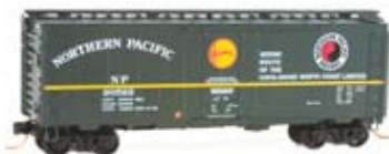
40' Standard Box Car, Plug Door Northern Pacific • Rd# 98522 Item# 021 00 170...$24.30