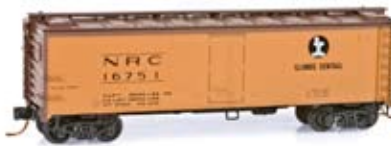
40' Steel Ice Reefer w/ Preco Fan Illinois Central • NRC 16753 Item# 059 00 546...$24.10