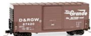
40' Hy Cube Box Car, Single Door Denver & Rio Grande Western • Rd# 67420 Item# 101 00 130...$28.65