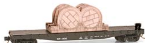
50' Flat Car, Fishbelly Sides w/ Side Mount Brakewheel Western Pacific w/Load • Rd# 1906 Item# 045 00 230...$17.85