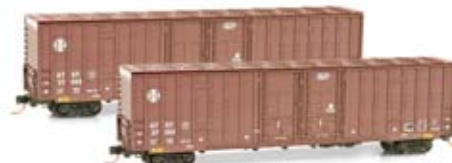
60' Excess Height Box Car, Double Plug Door, Waffle Sides Atchison, Topeka & Santa Fe • Rd# 37562 / 37565 Item# 103 00 061...$23.70 • Item# 103 00 062...$23.70