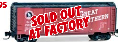
Z Great Northern #501 44 130...$30.80

UP® is a registered trademark of the Union Pacific Railroad.