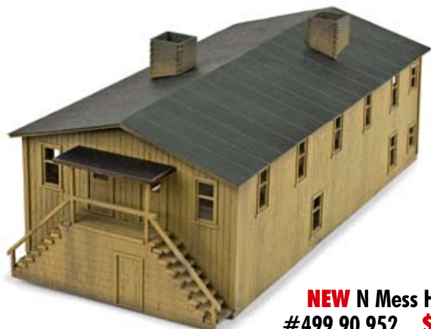
NEW N Mess Hall Kit #499 90 952...$29.95