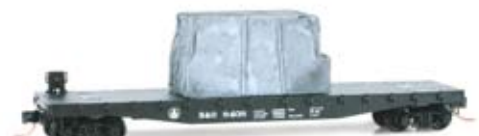
50' Flat Car, Fishbelly Sides w/ Side Mount Brakewheel Baltimore & Ohio • Rd# 8408 Item# 045 00 420...$18.85