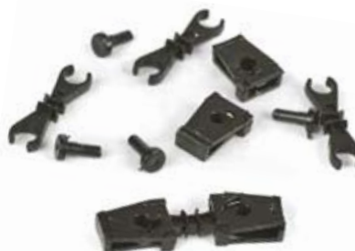
NEW! Link & Pin Style Couplers (2-pair) #001 02 060...$8.95