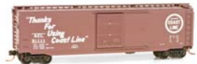
50' Standard Box Car, Single Door Atlantic Coast Line • Rd# 31111 Item# 031 00 140...$17.15