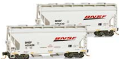
2 Bay ACF Centerflow Covered Hopper Burlington Northern Santa Fe • Rd# 405426 / 405430 Item# 092 00 281...$27.35 • Item# 092 00 282...$27.35