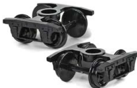
NEW! Rigid Wood Beam Truck w/o coupler (1 pair) #003 02 190...$3.95