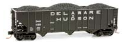
100 Ton 3 Bay Open Hopper, Rib Sides w/ Coal Load Delaware & Hudson • Rd# 1199 Item# 108 00 220...$20.40