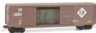
50' Standard Box Car, Double Door w/o Roofwalk Erie Lackawanna w/Load • Rd# 67018 Item# 037 00 100...$20.85