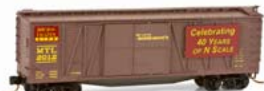
40' Outside Braced Box Car, 1 1/2 Door w/ vertical brakewheel MTL Anniversary • Rd# 2012 Item# 040 00 020...$22.45