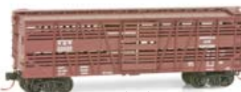
40' Despatch Stock Car Norfolk & Western • Rd# 33033 Item# 035 00 150...$17.90