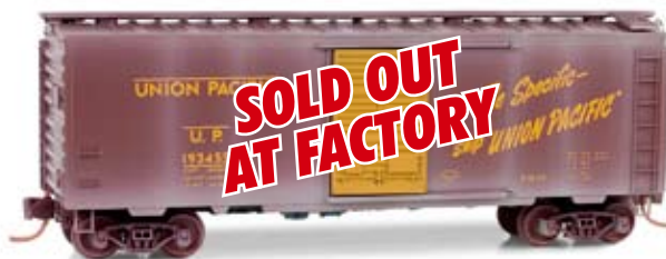
N Union Pacific® #020 44 296...$23.95