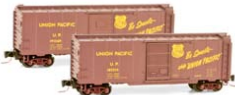
40' Standard Box Car, Single Door Union Pacific • Rd# 185519 / 190169 Item# 500 00 741...$23.75 • Item# 500 00 742...$23.75