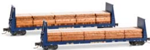
60' Bulkhead Flat Car Golden West Service w/ load • Rd# 443039 / Rd# 459003 Item# 527 00 111...$26.85 • Item# 527 00 112...$26.85