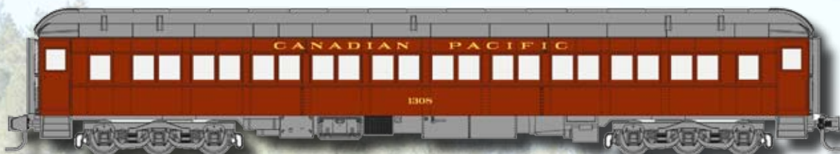
Paired Window Coach