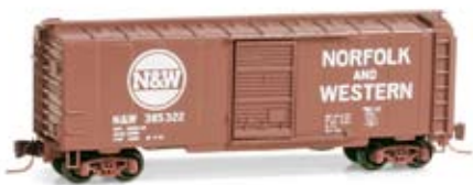
40' Standard Box Car, Single Door Norfolk & Western • Rd# 385322 Item# 500 00 730...$21.35