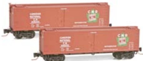
36' Wood Reefer Canadian National • Rd# 209300 / Rd# 209344 Item# 518 00 071...$20.85 • Item# 518 00 072...$20.85