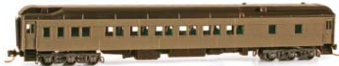
#142 00 001 .... 12-1 Sleeper... $20.40