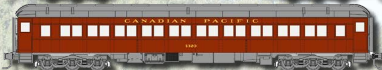
Paired Window Coach