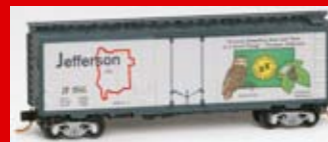
2012 Membership Car