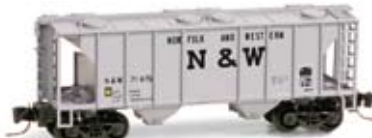
PS2 2-Bay Covered Hopper Norfolk & Western • Rd# 71475 Item# 531 00 190...$20.70