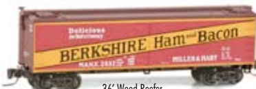
36' Wood Reefer Berkshire • Rd# 2032 Item# 518 00 080...$26.95