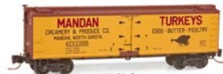
36' Wood Reefer Mandan Turkey • Rd# 2000 Item# 518 00 050 ...$27.30