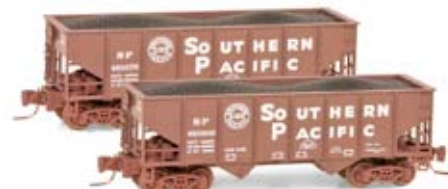
33' Twin Bay Hopper, Rib sides Southern Pacific • Rd# 460600 / Rd# 460676 Item# 534 00 022... $18.60 • Item# 534 00 021... $18.60