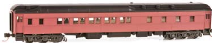
#141 00 002 .... 10-1-2 Sleeper..... $20.40