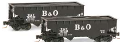
33' Twin Bay Hopper, Offset sides Baltimore & Ohio • Rd# 727044 / Rd# 727046 Item: #533 00 021... $17.80 • Item #533 00 022...$17.80