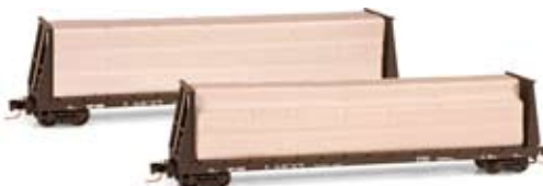
60' Bulkhead Flat Car Western Pacific w/ load • Rd# 1466 / Rd# 1483 Item# 527 00 101...$22.85 • Item# 527 00 102...$22.85