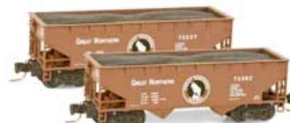
33' Twin Bay Hopper, Offset sides Great Northern • Rd# 73237 / Rd# 73363 Item# 533 00 041... $18.60 • Item# 533 00 042... $18.60