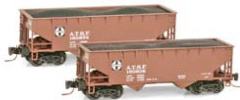
33' Twin Bay Hopper, Offset sides Atchison, Topeka & Santa Fe • Rd# 180806 / Rd# 180874 Item #533 00 011... $18.60 • Item# 533 00 012... $18.60