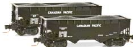
33' Twin Bay Hopper, Offset sides Canadian Pacific • Rd# 354025 / Rd# 354037 Item# 533 00 031...$17.10 • Item# 533 00 032...$17.10