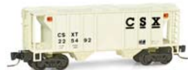
PS2 2-Bay Covered Hopper CSXT • Rd# 225492 Item #531 00 200...$23.10