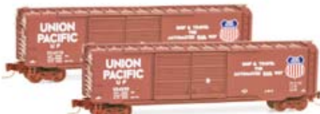
50' Standard Box Car, Double Doors Union Pacific • Rd# 554038 / 554050 Item# 506 00 271...$25.65 • Item# 506 00 272...$25.65