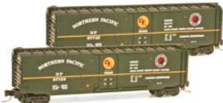
50' Standard Box Car, Plug Doors Northern Pacific • Rd# 97729 / 97732 Item# 507 00 471...$27.80 • Item #507 00 472...$27.80