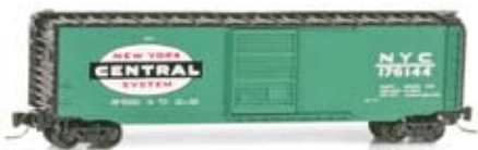
50' Standard Box Car, Single Door New York Central • Rd# 176144 Item# 505 00 280...$29.60