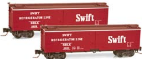
36' Wood Reefer Swift Refrigerator • Rd# 5820 / Rd# 15392 Item# 518 00 061...$28.30 • Item# 518 00 062...$28.30