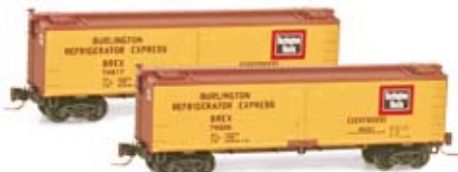
36' Wood Reefer Burlington Refrigerator • Rd# 74606 / Rd# 74617 Item# 518 00 031...$24.90 • Item# 518 00 032...$24.90