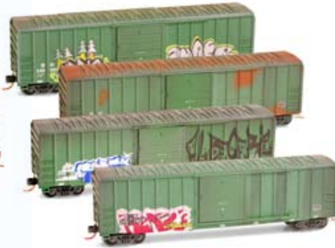
Burlington Northern Weathered and Graffiti 4 pack 50' Ribside Box Car, Single Door, w/o roofwalk 993 05 090 ...$119.95