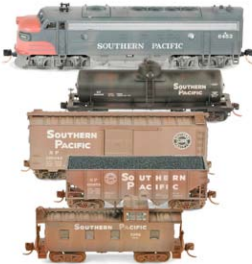
Southern Pacific Weathered Set 993 01 170 ...$209.95