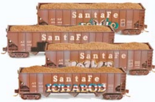
ATSF Weathered and Graffiti 4 pack 100 Ton, 3 Bay Hopper, Ribside 993 05 080 ...$119.95