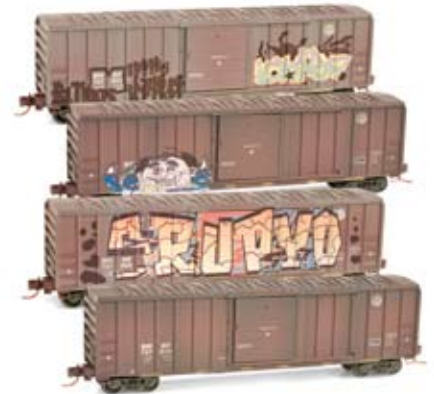
BNSF Weathered and Graffiti 4 pack 50' Ribside Box Car, Single Door, w/o roofwalk 993 05 100 ...$119.95