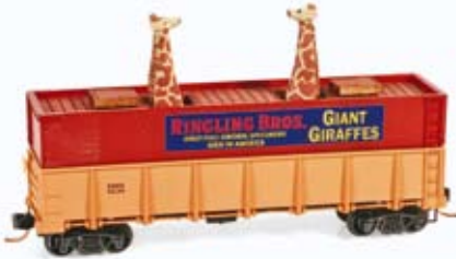
Giraffe Car 084 00 040...$34.95