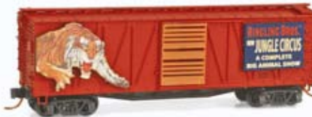
Tiger Car 028 00 180...$34.95