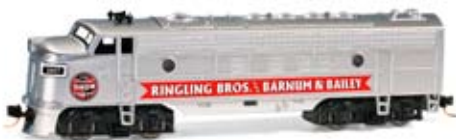
Silver Loco 985 00 721 (Rd# 1907)...$119.95 985 00 722 (Rd# 1919)...$119.95