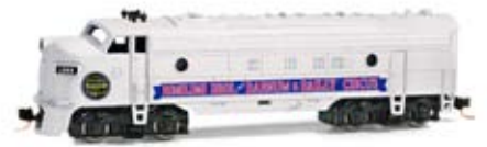
White Loco 985 00 731...$119.95