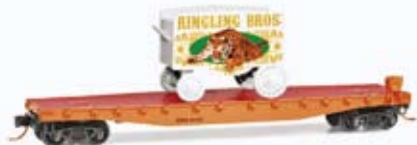
Flat Car w/ Wagon 045 00 371 ...$34.95