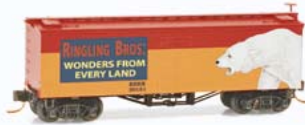
Polar Bear Car 058 00 100...$34.95