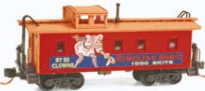
Clown Caboose 051 00 270...$34.95