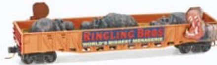
Hippo Car 063 00 020...$34.95