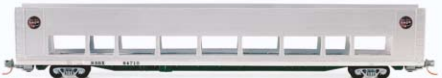
Silver Autorack 112 00 710...$34.15