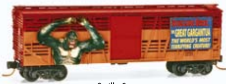
Gorilla Car 035 00 190...$34.95