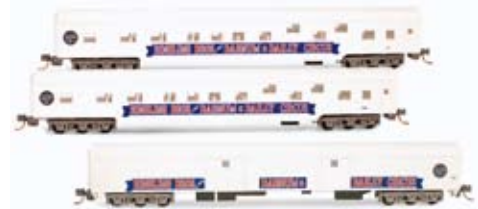
White Multi-car Pack 993 00 053...$89.95