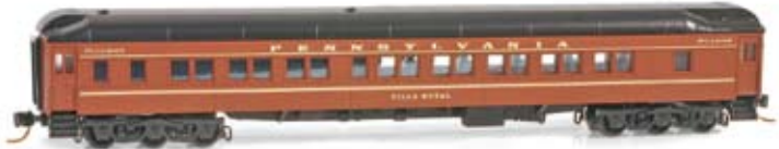
10-1-2 Sleeper # 141 00 050...$24.30

This 10-1-2 Heavyweight Sleeper is painted Tuscan Red with a black roof mask; lettering is in Pennsylvania Railroad's 'Buff' color. It was built in 1911 by Pullman as the 'El Monte.' It was rebuilt in 1931 and named 'Villa Royal,' a work equipment car. It ran through the Eastern District up into the 1960s on six-wheel RPO trucks. The Pullman 10-1-2 Heavyweight Sleepers were built from the Pullman Plan # 3585—construction was modular, making it possible for floor plans to economically evolve with the times. Cars were generally in service through the 1960s.