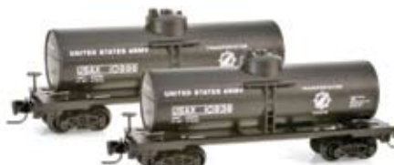
40' Tank Car US Army • Rd# 10936 / 10986 Item# 530 00 281...$20.20 • Item# 530 00 282...$20.20