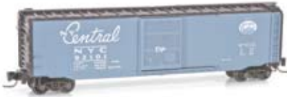
50' Standard Box Car, Single Door New York Central • Rd.# 92101 Item# 505 00 250...$25.85