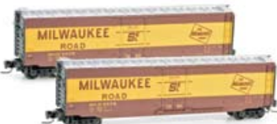
50' Standard Box Car, Plug Door Milwaukee Road • Rd# 2632 / 2635 Item# 507 00 431...$31.20 • Item# 507 00 432...$31.20