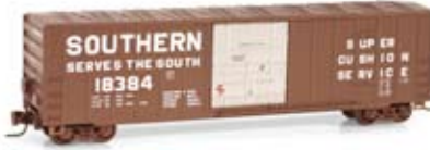
50' Rib Side Box Car, Plug Door w/o Roofwalk Southern • Rd# 18384 Item# 511 00 082...$25.80