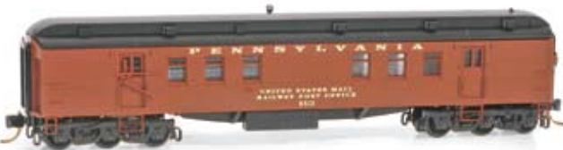
RPO Car # 140 00 050...$20.65

This 60' RPO Heavyweight Passenger Car is painted Tuscan Red with a black roof mask; lettering is in Pennsylvania Railroad's 'Buff' color. It was built in 1910 as class M70 by Pullman with rebuild dates in 1935 (rebuilt as class M70B), 1949 and 1956 when it was rebuilt as a class M70BA. It ran through the Eastern District up into the late 1960s on six-wheel RPO trucks.