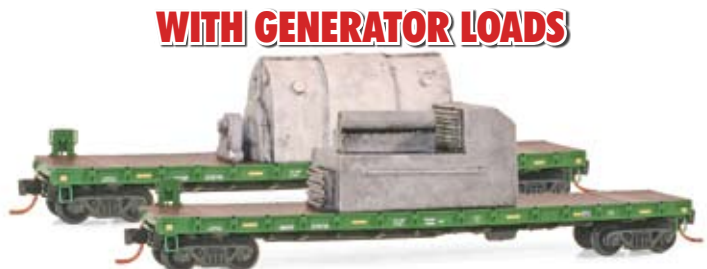
WITH GENERATOR LOADS # 044 00 121...$21.90 # 044 00 122...$21.90

These 50' flat cars with straight sides and side mount brake wheels and loads are painted black with white lettering and logos. They run on Barber Roller Bearing trucks. These steel underframed flat cars with wooden floors proved to be a solid design. They served for some years in Burlington Northern green before being renumbered into BNSF numbers in 2008.