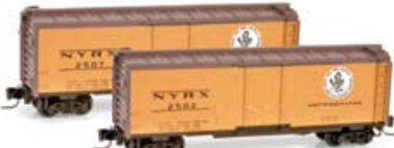
40' Standard Box Car, Plug Door New York Central • Rd.# 2502 / 2507 Item# 502 00 251...$26.95 • Item# 502 00 252...$26.95