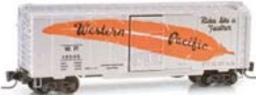
40' Standard Box Car, Single Door Western Pacific • Rd# 19505 Item# 500 00 080...$24.90