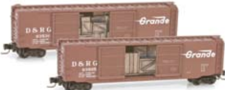
50' Standard Box Car, Double Doors Denver & Rio Grande Western • Rd# 63505 / 63536 Item# 506 00 141...$20.70 • Item# 506 00 141...Rd# 63536