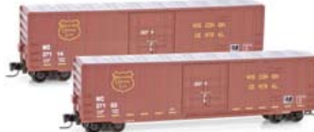
50' Rib Side Box Car, Plug Door w/o Roofwalk Wisconsin Central • Rd# 27102 / 27114 Item# 511 00 091...$24.80 • Item# 511 00 092...$24.80