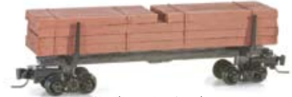
40' Modern Log Car w/ Uprights Log Car with Redwood Load Item# 538 00 090...$17.80