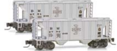
PS2 2-Bay Covered Hopper Boston & Maine • Rd# 2752 / 2754 Item# 531 00 131...$22.35 • Item# 531 00 132...$22.35