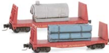
40' Bulkhead Flat Car Delaware & Hudson w/ Loads • Rd# 8006 / 8008 Item# 526 00 101...$20.95 • Item# 526 00 102...$20.95