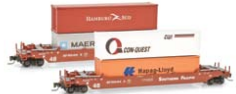
70' Gunderson Well Car Southern Pacific • Rd# 513414A / 513414B Item# 540 00 041...$35.75 • Item# 540 00 042...$35.75