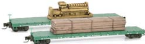
60' Flat Car Great Northern w/ Loads • Rd# 161151 / 161158 Item# 524 00 081...$20.50 • Item# 524 00 082...$20.50