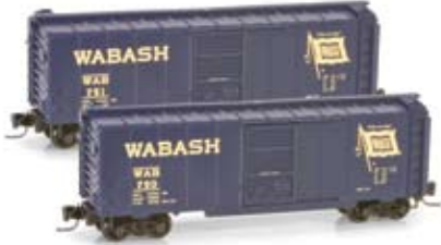
40' Standard Box Car, Single Door Wabash • Rd.# 750 / 751 Item# 500 00 641...$22.20 • Item# 500 00 642...$22.20