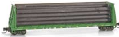
60' Bulkhead Flat Car Canadian Pacific w/ Load • Rd# 317377 Item# 527 00 072...$24.50