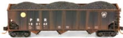
100 Ton 3 Bay Open Hopper with Rib Sides Pennsylvania Railroad • 180162 Item #108 44 040...$24.55