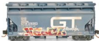
Two Bay ACF Covered Hopper Grand Trunk • Rd# 315063 Item #092 44 010...$27.70