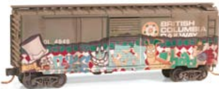
40' Standard Box Car, Plug Door and sliding door British Columbia Railroad • Rd# 4949 Item #022 44 080...$31.45