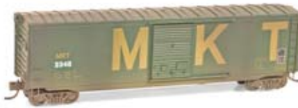
50' Standard Box Car, Single door no roofwalk Missouri-Kansas-Texas ® • Rd# 2348 Item #077 44 210...$24.65