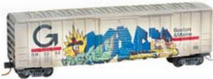
50' Ribside Box Car, Single Door, no roofwalk Boston & Maine Item #025 44 400...$30.85