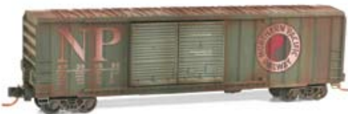
50' Ribside Box Car, Double Door, no roofwalk Northern Pacific • Rd# 390086 Item #030 44 210...$29.10