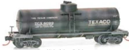
39' Single Dome Tank Car Texaco Item #065 44 680...$24.70