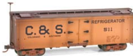
30' Composite Wood Reefer Colorado & Southern Item #850 44 070...$44.95