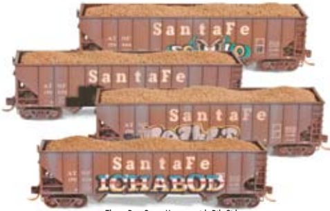
Three Bay Open Hopper with Rib Sides Atchison, Topeka & Santa Fe • 4 pack Item #993 05 080...$119.95