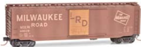
50' Standard Box Car, Single Door Milwaukee Road Item #031 44 380...$23.65