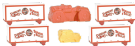
Modern Wagons 462 00 030 ...$59.95