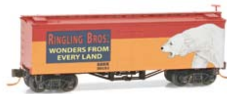
Polar Bear Car 058 00 100 ...$34.95