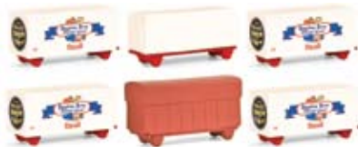
70's era wagons 462 00 040 ...$59.95