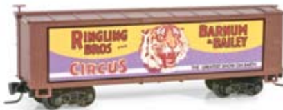
Billboard Series #8 515 00 608...$29.95