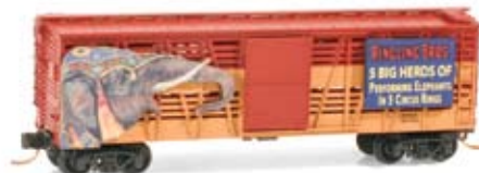
Elephant Car 035 00 200 ...$34.95