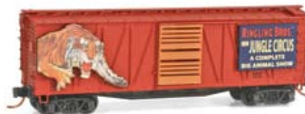
Tiger Car 028 00 180 ...$34.95