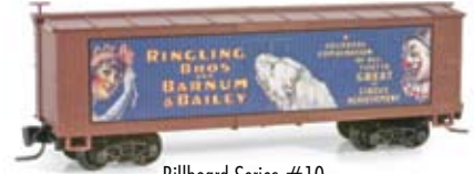
Billboard Series #10 515 00 610...$29.95