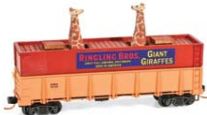
Giraffe Car 084 00 040 ...$34.95