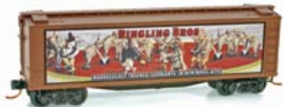
Billboard Series #11 047 00 411...$25.95