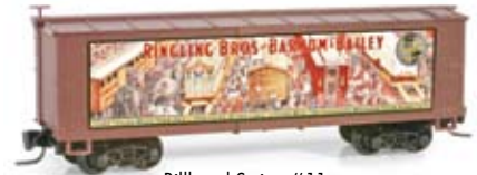
Billboard Series #11 515 00 611...$29.95