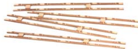
Wagon Racks 499 90 920 ...$11.95