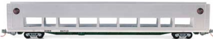
Autorack 112 00 710 ...$34.15