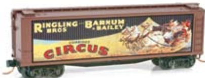
Billboard Series #6 047 00 406...$25.95