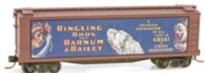
Billboard Series #8 047 00 408...$25.95