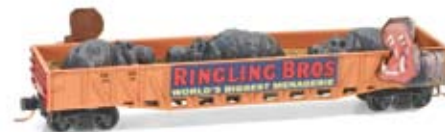
Hippo Car 063 00 020 ...$34.95