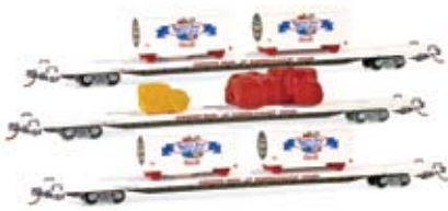
Flat Car w/wagon Runner Pack 993 00 050 ...$139.95