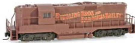
Ringling Loco 982 01 039...$175.95