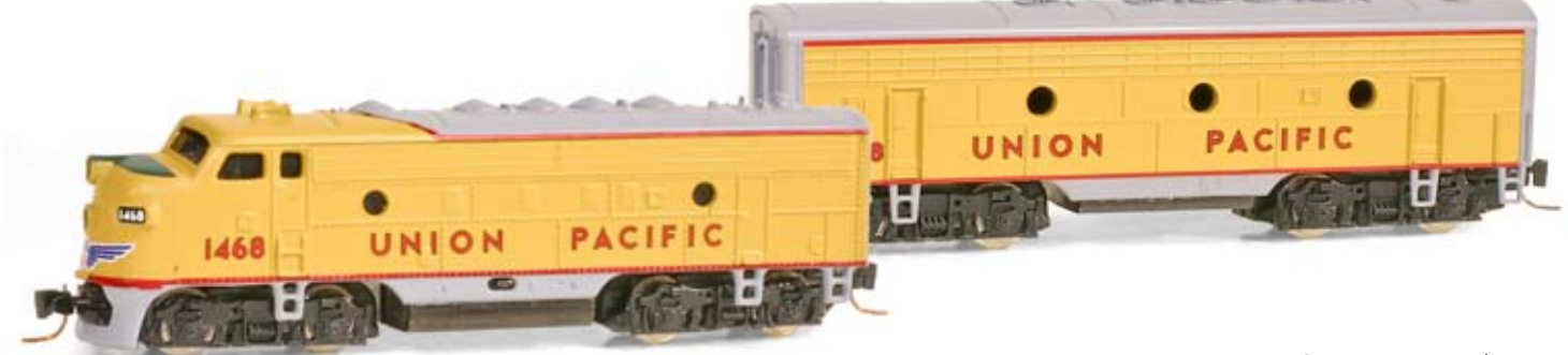
UP® is a registered trademark of the Union Pacific Railroad.

These F-7 locomotives are painted UP Yellow with red horizontal stripes flanking the yellow bands. The roofs and ends are painted gray. Lettering is red and outlined in black. These exciting releases represent the livery of the multi-colored Union Pacific F-Series locomotives. Equipped with Blomberg trucks, many of these 1951 UP units joined the immense F3 fleet and some of the F3s, including these locos, were improved to F7 standards. The UP F7 fleet worked for only 10 to 11 years before they were traded-in for GP30s and GP35/DD35s.