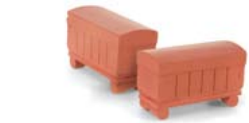
Red Wagons 799 43 930...$9.95