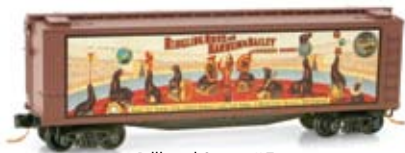
Billboard Series #7 047 00 407...$25.95