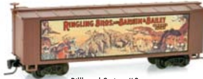
Billboard Series #3 515 00 603...$29.95