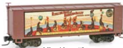
Billboard Series #7 515 00 607...$29.95