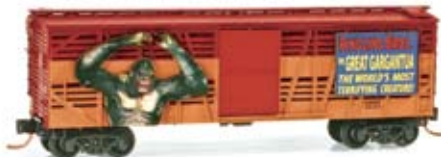
Gorilla Car 035 00 190 ...$34.95