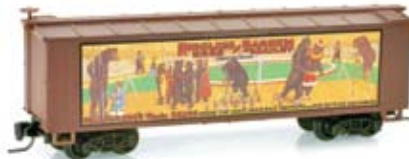
Billboard Series #5 515 00 605...$29.95