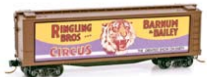
Billboard Series #10 047 00 410...$25.95