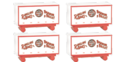
Modern Wagons 760 00 050...$49.95