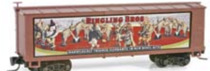
Billboard Series #9 515 00 609...$29.95