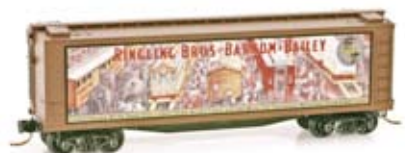
Billboard Series #9 047 00 409...$25.95