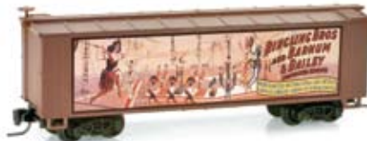
Billboard Series #4 515 00 604...$29.95