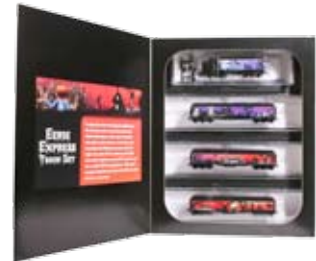
Eerie Express Train Set #993 21 110...$189.95