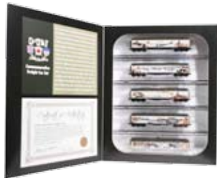
D-Day Freight Car Set #993 21 100...$179.95