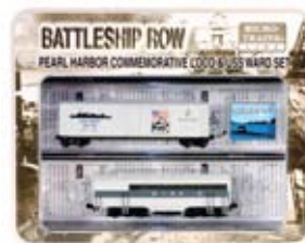
Battleship Row B-Unit & USS Ward #993 21 061...$129.95