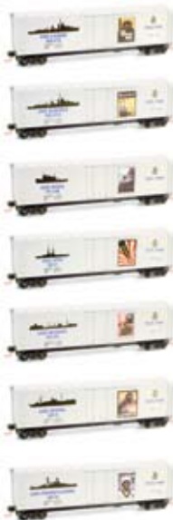
Battleship Row Freight Car Set #2 #993 21 060...$159.95