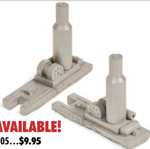
NOW AVAILABLE! #799 91 905...$9.95