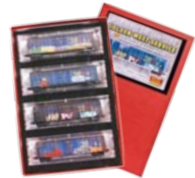
GWS Weathered Runner Pack #993 05 070...$119.95