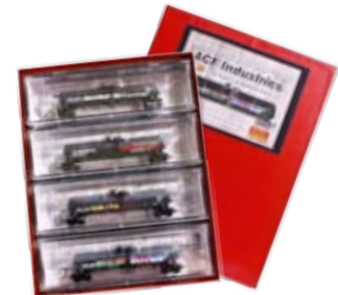
ACF Weathered Runner Pack #993 05 060...$129.95