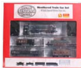
NYC Weathered Set #993 01 150...$199.95