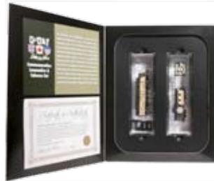
D-Day Loco & Caboose Set #993 21 101...$169.95