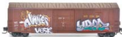
50' Rib Side Box Car, Plug Door w/o Roofwalk Weathered / Graffiti—Wisconsin Central Item# 511 44 090...$28.80