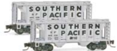
PS2 2-Bay Covered Hopper Southern Pacific • Rd# 401333 / 401339 Item# 531 00 151...$19.95 • Item# 531 00 152...$19.95