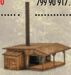
Boiler Shop 799 90 943...$23.95