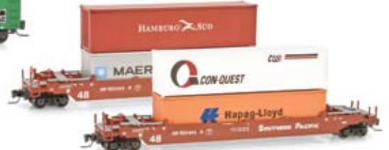
70' Gunderson Well Car Southern Pacific • Rd# 513414A / 513414B Item# 540 00 041...$35.75 • Item# 540 00 042...$35.75