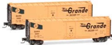
50' Standard Box Car, Plug Door Denver & Rio Grande Western • Rd# 50920 / 50925 Item# 507 00 451...$27.20 • # 507 00 452...$27.20