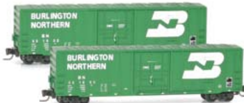
50' Rib Side Box Car, Plug Door w/o Roofwalk Burlington Northern • Rd# 321625 / 321632 Item# 511 00 121...$23.80 • Item# 511 00 122...$23.80