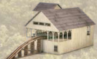
Saw Mill 799 90 923...$74.95