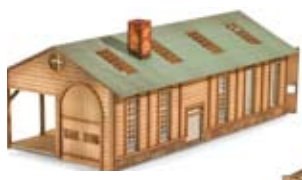
View of opposite side.