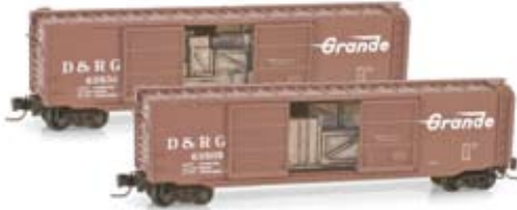
50' Standard Box Car, Double Doors Denver & Rio Grande Western • Rd# 63505 / 63536 Item# 506 00 141...$20.70 • Item# 506 00 142... $20.70