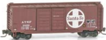
40' Standard Box Car, Double Doors Atchison, Topeka & Santa Fe • Rd# 50256 Item# 501 00 200...$24.45