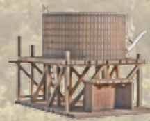
Water Tank 799 90 938...$27.95