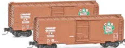
40' Standard Box Car, Single Door Canadian National • Rd# 51992 / 51999 Item# 500 00 671...$22.20 • Item# 500 00 672...$22.20