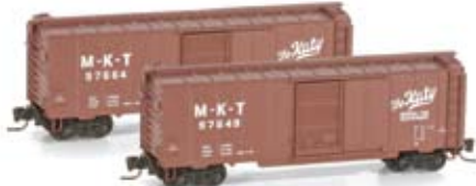
40' Standard Box Car, Single Door Missouri-Kansas-Texas • Rd# 97649 / 97664 Item# 500 00 661...$22.20 • Item# 500 00 662...$22.20