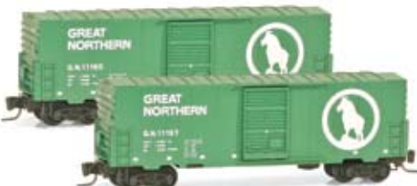
40' Standard Box Car, Single Door w/o Roofwalk Great Northern • Rd# 11157 / 11160 Item# 503 00 101...$22.60 • # 503 00 102...$22.60