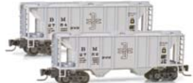
PS2 2-Bay Covered Hopper Boston & Maine • Rd# 2752 / 2754 Item# 531 00 131...$22.35 • Item# 531 00 132...Rd# 22.35