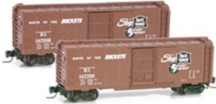
40' Standard Box Car, Single Door Rock Island • Rd# 147760 / 147982 Item# 500 00 621...$20.60 • Item# 500 00 622...$20.60