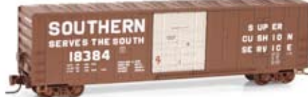
50' Rib Side Box Car, Plug Door w/o Roofwalk Southern • Rd# 18384 Item# 511 00 082...$25.80