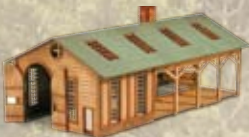
Loco Shed 799 90 947...$36.95