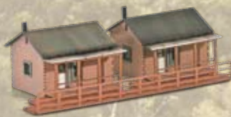
Camp Houses (2pk) 799 90 940...$24.95