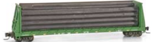
60' Bulkhead Flat Car Canadian Pacific w/ Load • Rd# 317377 Item# 527 00 072...$24.50