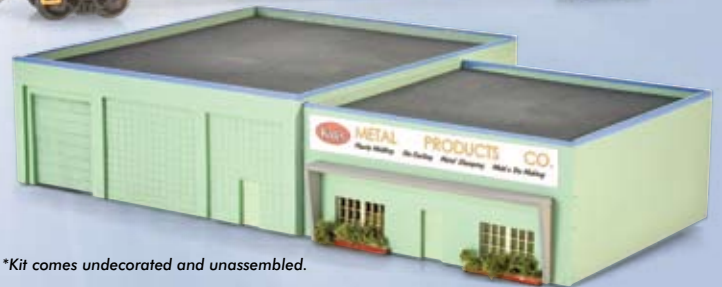
*Kit comes undecorated and unassembled.