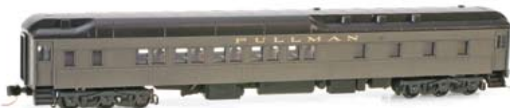
Pullman #141 00 010...$22.70

Pullman equipment was operated on the Great Northern beginning in 1922, when GN ceased its own sleeping car operation. The Pullman Heavyweight Sleepers — '10-1-2' (10 Section-1 Drawing Room-2 Compartment Sleepers) are "named" cars and were built specifically for Oriental Limited service in 1923 and lettered for such. In 1929, this '10-1-2' was re-lettered for the "EMPIRE BUILDER" with small "PULLMAN" lettering in the upper left and right corners and named "HIDDEN LAKE".