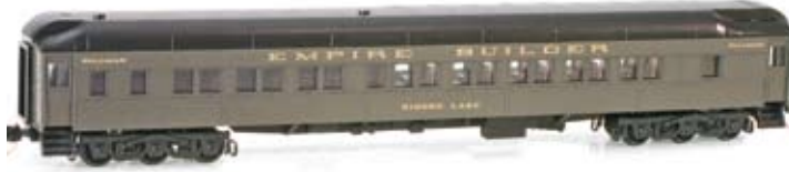
Great Northern #141 00 020...$22.70