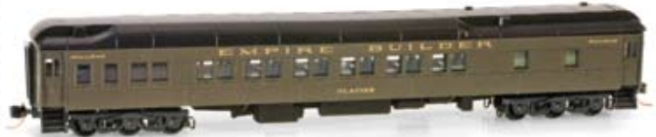
Great Northern #142 00 020...$22.70