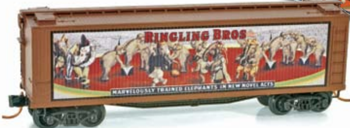
www.Ringling.com