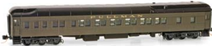
Pullman #142 00 010...$22.70

This Pullman heavyweight sleeper is painted Pullman Green with "Empire Builder" logo and lettering in metallic gold. It was built in 1910 by Pullman-Standard and runs on six wheel passenger trucks. From 1910 through 1930 Pullman built well over 8,000 steel sleeping, parlor and club/lounge cars. The introduction of the steel cars brought the end of the luxurious, artisan-crafted and custom-designed wooden cars which had been the rule since the 1880s. With the opening of the Pennsylvania Station in New York in 1910 and the Grand Central Terminal in 1913, passenger safety in the tunnels approaching these buildings demanded a more noncombustible material than wood.