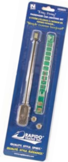
Easy Peasy Lighting Kit #995 14 001... $8.95