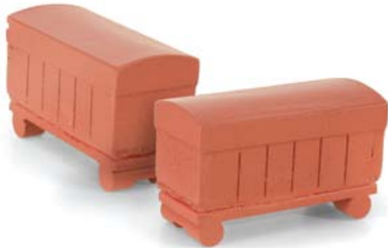
Z Red Circus Wagon Load #799 43 930 (2-pack)...$9.95