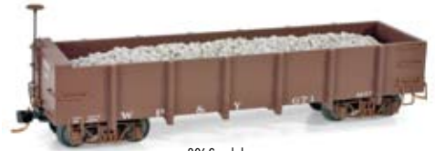
30' Gondola White Pass & Yukon • Rd# 671 Item# 860 00 050...$ 39.95