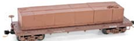
30' Flat Car Rio Grande Southern w/ Load • Rd# 7455 Item# 855 00 050...$35.30