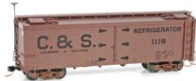
30' Composite Frame Reefer Colorado & Southern • Rd# 1118 Item# 850 00 060...$38.85