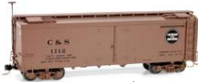
30' Composite Frame Reefer Colorado & Southern • Rd# 1112 Item# 850 00 050...$38.85