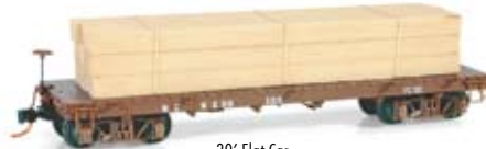
30' Flat Car NCSRR w/ Load • Rd# 255 Item# 855 00 040...$35.30