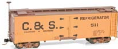
30' Composite Frame Reefer Colorado & Southern • Rd# 511 Item# 850 00 070...$42.45