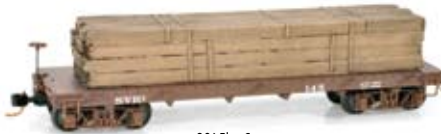
30' Flat Car Sumpter Valley w/ Load • Rd# 145 Item# 855 00 060...$35.30