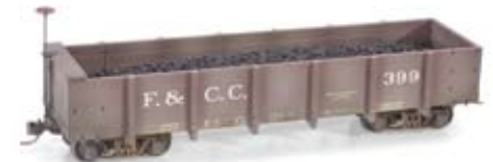
30' Gondola Weathered Florence & Cripple Creek w/ Load • Rd# 399 Item# 860 44 030...$39.95