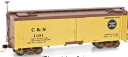
30' Composite Frame Reefer Colorado & Southern • Rd# 1101 Item# 850 00 010...$39.45