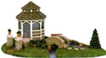
Patriot Park #960 09 072 ...$6.50