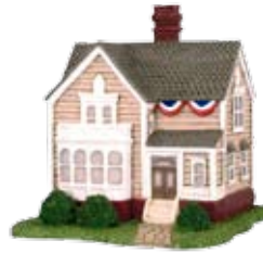
Banker's House #960 07 027 ...$6.50