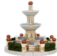
Town Square Fountain #960 09 071 ...$6.50