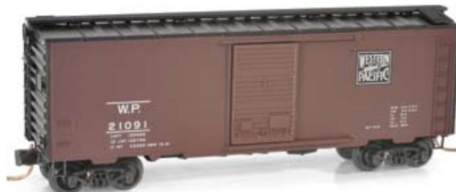
*WP® is a registered trademark of the Union Pacific Railroad #020 00 816...$22.95

This 40' standard box car with single door and no roofwalk is painted red with black roof and ends. It bears the black and silver "Feather River Route" herald and silver lettering. This car was built in October 1951 by Pullman-Standard and runs on Bettendorf trucks. All but the first 20 of these 600 box cars were delivered with mineral red sides and black roof and ends. The series 20821-21400 is stenciled with this new Zephyr-inspired herald and lettering.