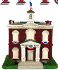
Freedom Hall #960 07 022 ...$8.00