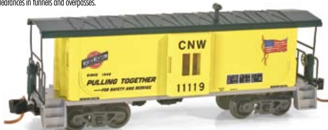
*CNW® is a registered trademark of the Union Pacific Railroad #130 00 030...$30.65

This bay window caboose is painted yellow with dark green roof with black, red and white logo and American flag. The lettering is black. It was built during the time period of 1965 to 1974 by International Car Co., serviced in November 1981, and runs on Swing-Motion Caboose Trucks. The bay window caboose afforded a better view of the side of the train and eliminated the falling hazard of the cupola. The bay window gained favor with many railroads also because it eliminated the need for additional clearances in tunnels and overpasses.