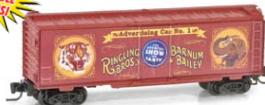
Z Scale #502 00 600...$34.85