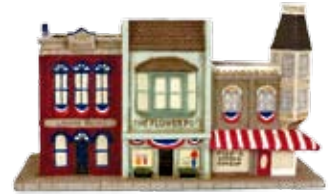
Main Street #1—Soda Shop #960 07 024 ...$8.00