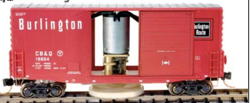
*Shown equipped with Magne-Matic® couplers