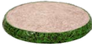
Liberty Town Center Base #960 05 005 ...$13.00