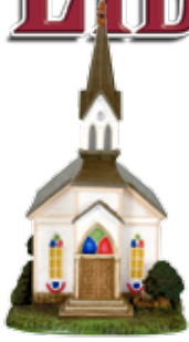
Liberty Town Church #960 07 021 ...$8.00