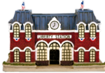
Liberty Station #960 07 023 ...$8.00