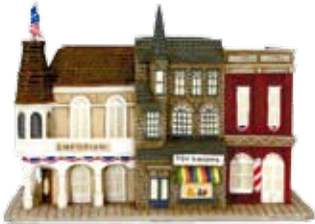
Main Street #2—Emporium #960 07 025 ...$8.00