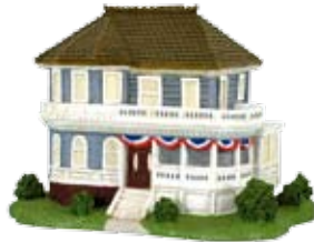
Mayor's House #960 07 026 ...$6.50