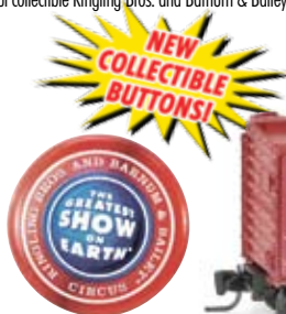
www.Ringling.com