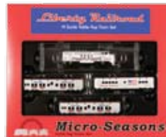
Liberty Railroad Train Set #993 21 030 ...$108.00