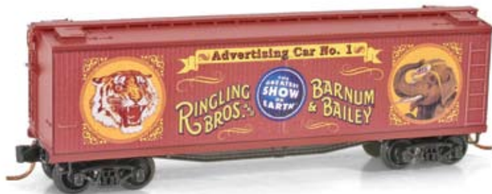
N Scale #047 00 400...$34.85

Advertising or advance cars traveled "in advance" of the circus and were responsible for promoting the coming show, which is why we are starting this new line of licensed products with a special Ringling Bros. and Barnum & Bailey™ advertising car! These colorful specialty cars will mark the beginning of an exciting line of N & Z scale themed and prototype products. Both cars will come with a beautiful collectible Ringling Bros. and Barnum & Bailey™ one inch diameter button! Order yours today!