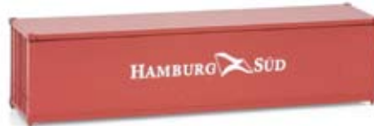
40' Hamburg Sud #761 00 030...$16.95