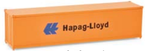
40' Hapag-Lloyd Containers #761 00 050...$16.95