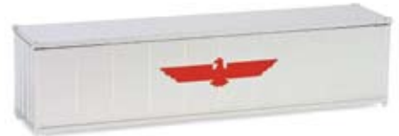
40' APL Containers #761 00 060...$16.95