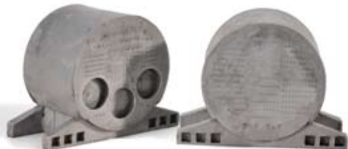
N Marine Boiler Loads #1 & 2 #499 43 954 (2-pack)...$8.95