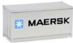
20' Maersk Containers #760 00 010...$16.95