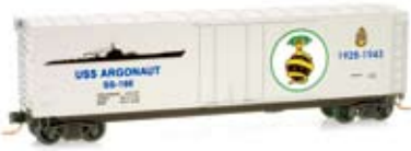
50' Standard Box Car, Plug Door w/o Roofwalk Navy Series—USS Argonaut • Rd# SS-166 Item #038 00 408...$18.95