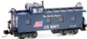
36' Riveted Steel Side Caboose, Offset Cupola Navy Series—Caboose • Rd# 2008 Item #100 00 310...$24.35