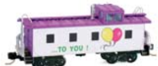
36' Riveted Steel Side Caboose, Offset Cupola Happy Birthday Item #100 00 270...$26.35