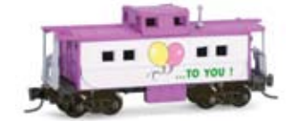
Center Cupola Caboose Happy Birthday Item #535 00 250...$23.60