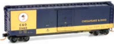
50' Standard Box Car, Single Door Chesapeake & Ohio • Rd# 21463 Item #031 00 073...$46.25