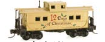
Center Cupola Caboose 12 Days—Caboose • Rd# 13 Item #535 00 230...$21.40