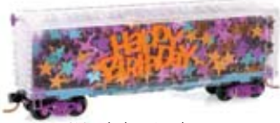
40' Standard Box Car, Plug Door Happy Birthday • Rd# 2007 Item #021 00 530...$13.75