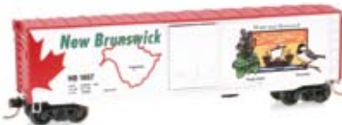
50' Standard Box Car, Single Door w/o Roofwalk Canadian Series—New Brunswick • Rd# 1867 Item #077 00 158...$18.25