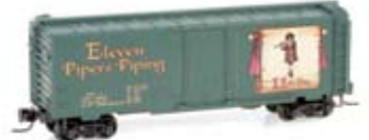
40' Standard Box Car, Plug Door 12 Days—Eleven Pipers Piping • Rd# 11 Item #502 00 410...$23.75