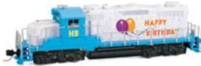
GP-20 Locomotive Happy Birthday Item #985 00 206...$109.95