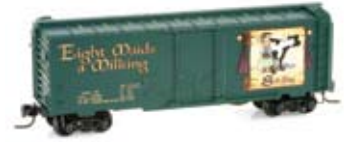
40' Standard Box Car, Plug Door 12 Days—Eight Maids a Milking • Rd# 08 Item #502 00 380...$23.75