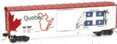
50' Standard Box Car, Single Door w/o Roofwalk Canadian Series—Quebec • Rd# 1867 Item #077 00 152...$18.25