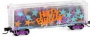
40' Standard Box Car, Plug Door Happy Birthday • Rd# 2007 Item #502 00 300...$17.15