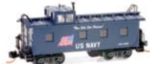
36' Riveted Steel Side Caboose, Offset Cupola US Navy Series—Caboose • Rd# 2008 Item #100 00 310...$24.35