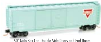
50' Auto Box Car, Double Side Doors and End Doors Conoco • Rd# 50004 Item #078 00 120...$18.35