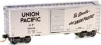
40' Standard Box Car, Single Door Union Pacific • Rd# 903658 Item #020 00 756...$14.90