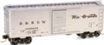
40' Standard Box Car, Single Door Denver & Rio Grande Western • Rd# 69035 Item #020 00 776...$14.90