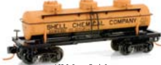
ACF 3-Dome Tank Car Shell Oil Company • Rd# 651 Item #066 00 011...$22.70