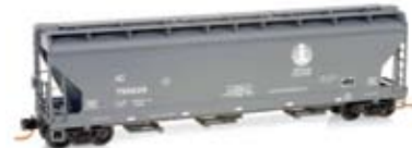
3 Bay ACF Covered Hopper w/ Elongated Hatches Illinois Central • 799626 Item #094 00 200...$24.40