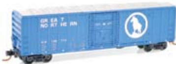
50' Rib Side Box Car, Plug Door w/o Roofwalk Great Northern • Rd# 138710 Item #027 00 070...$20.20