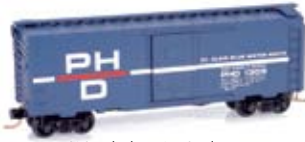
40' Standard Box Car, Single Door Port Huron & Detroit • Rd# 1309 Item #020 0 150...$18.50