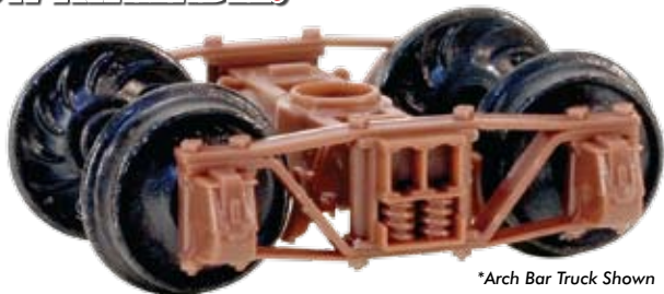
*Arch Bar Truck Shown