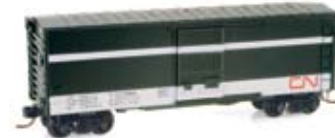
40' Box Car, Single Door, Full Ladders w/o Roofwalk Canadian National • Rd# 11064 Item #073 00 070...$19.95