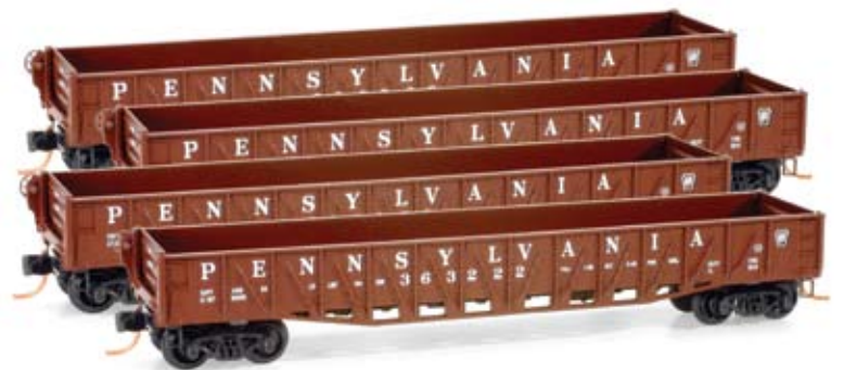
Pennsylvania Railroad Runner Pack

Road Numbers: 363222, 363236, 363300, 363305