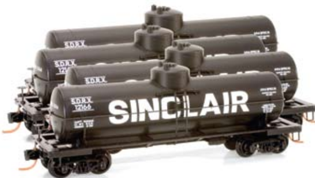
Sinclair Runner Pack

Accepting Pre-Orders through March 31 st