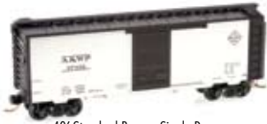
40' Standard Boxcar, Single Door Atlanta & West Point • Rd# 37302 Item #020 00 746...$15.70