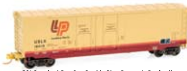
50' Standard Box Car, Double Plug Door w/o Roofwalk Louisiana Pacific • Rd# 18019 Item #075 00 150...$23.40