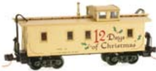
34' Wood Sheathed Caboose, w/Straight Cupola 12 Days of Christmas • Rd# TDOC 13 Item #051 00 250...$22.90