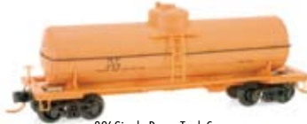
39' Single Dome Tank Car Northern Pacific • Rd# 255 Item #065 00 620...$16.45