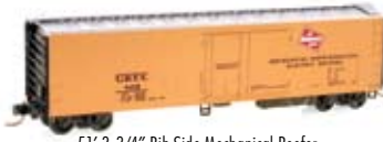
51' 3-3/4" Rib Side Mechanical Reefer Milwaukee Road • Rd# 805 Item #069 00 060...$22.35