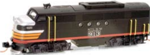
St. Louis-Southwestern® #987 01 031...$129.95