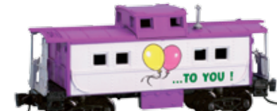
Caboose Happy Birthday Car Item #535 00 250...$23.60