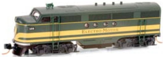
Electro-Motive Company #987 01 121...$129.95