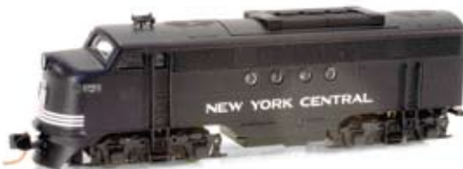
New York Central #987 01 021...$129.95

These powered FT A-unit locomotives are remaining stock from previous runs that didn't have enough B-units to send out as A/B sets. Limited quantities are available so place your order today!