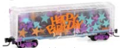
40' Standard Box Car, Plug Door Happy Birthday Car • Rd# 2007 Item #502 00 300...$17.50