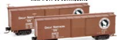
40' Double Sheathed Wood Box Car, Single Door Great Northern ® • Rd# 24872 / 24884 Item #515 00 161...$18.90 / Item #515 00 162...$18.90