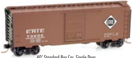
40' Standard Box Car, Single Door Erie • Rd# 79006 Item #020 00 870...$18.10