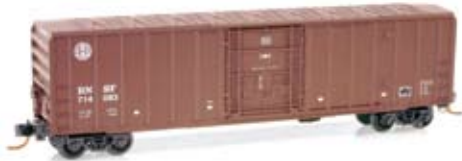
50' Rib Side Box Car, Plug Door w/o roofwalk BNSF • Rd# 714083 Item #027 00 300...$15.20