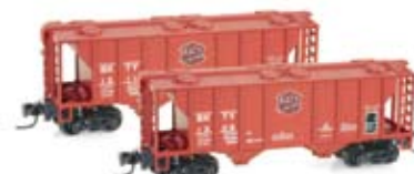
PS-2 Two Bay Covered Hopper Missouri-Kansas-Texas ® • Rd# 1311 / 1308 Item #531 00 031...$19.95 / Item #531 00 032...$19.95

99300011...Canadian National Runner Pack...$54.95 99300012...Norfolk & Western Runner Pack...$54.95 99301100...Marine Corps Set...$199.95