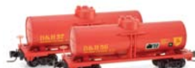
40' Tank Car Delaware & Hudson ® • Rd# 56 / 57 Item #530 00 221...$20.50 / Item #530 00 222...$20.50