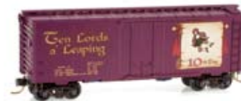
40' Standard Box Car, Plug Door 12 Days of Christmas—Day 10 • Rd# 10 Item #502 00 400...$23.75