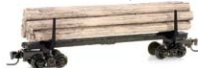
40' Modern Log Car w/ Uprights Item #538 00 050...$17.80