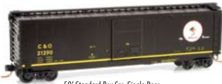
50' Standard Box Car, Single Door Chesapeake & Ohio • Rd# 21290 Item #031 00 071...$29.85