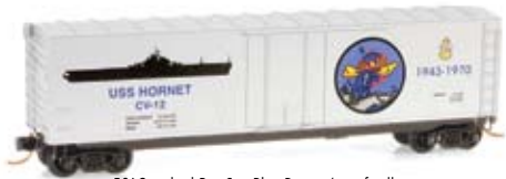
50' Standard Box Car, Plug Door w/o roofwalk USS Hornet • Rd# CV-12 Item #038 00 402...$18.95