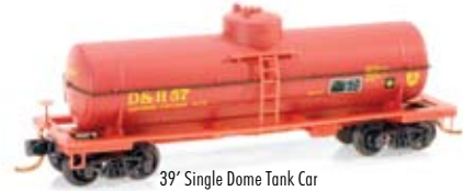
39' Single Dome Tank Car Delaware & Hudson • Rd# 57 Item #065 00 650...$20.45