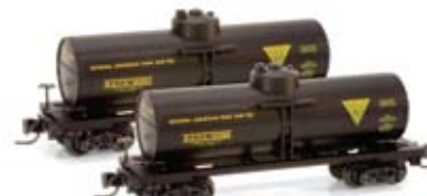
40' Tank Car General American Tank Corp ® • Rd# 19285 / 19294 Item #530 00 041...$18.10 / Item #530 00 042...$18.10