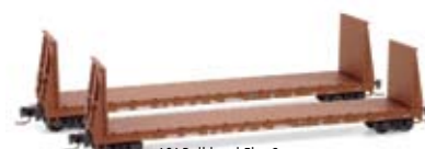
60' Bulkhead Flat Car St. Louis-Southwestern ® • Rd# 88219 / 88267 Item #527 00 041...$17.25 / Item #527 00 042...$17.25