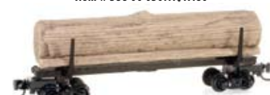
40' Modern Log Car w/ Uprights Item #538 00 050...$17.80