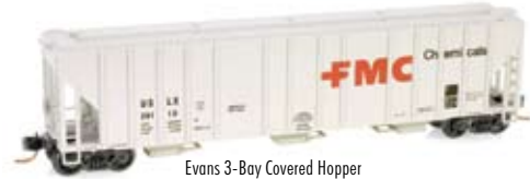
Evans 3-Bay Covered Hopper FMC Chemicals • Rd# 20110 Item #099 00 030...$18.35