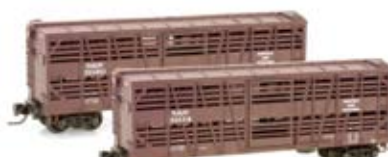
40' Despatch Stock Car, Single Door Norfolk & Western ® • Rd# 33134 / 33150 Item #520 00 151...$18.85 / Item #520 00 152...$18.85