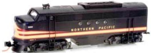
Northern Pacific #987 01 131...$129.95