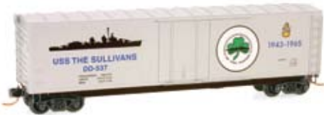
50' Standard Box Car, Plug Door w/o roofwalk USS Sullivans • Rd# DD 537 Item #038 00 407...$18.95