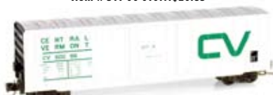
50' Rib Side Box Car, Plug Door w/o Roofwalk Central Vermont ® • Rd# 50096 Item #511 00 061...$28.15