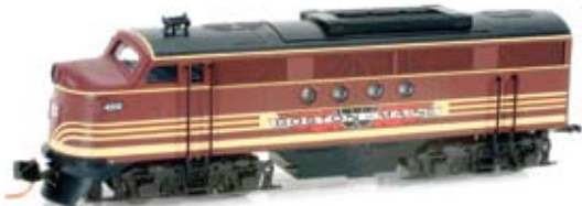
Boston & Maine #987 01 141 (#4201)...$129.95 #987 01 142 (#4200)... $129.95