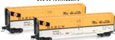
50' Standard Box Car, Plug Door Denver & Rio Grande Western ® • Rd# 60812 / 60810 Item #507 00 391...$27.65 / Item #507 00 392...$27.65