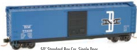
50' Standard Box Car, Single Door Boston & Maine • Rd# 77405 Item #031 00 360...$18.25