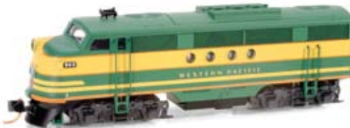
Western Pacific® #987 01 071 (#901)...$129.95 #987 01 072 (#903)...$129.95