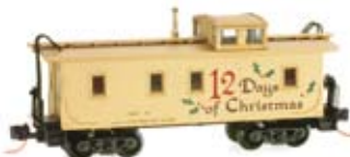
34' Wood Sheathed Caboose w/ Straight Cupola 12 Days of Christmas • Rd# 13 Item #051 00 250...$22.90