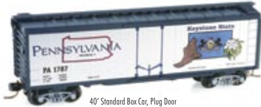
40' Standard Box Car, Plug Door Pennsylvania State Car • Rd# 1787 Item #02100410...$19.85