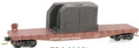
50' Flat Car, Fishbelly Sides Canadian National • Rd# 54201 Item #04500320...$16.45