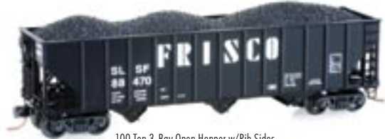
100 Ton 3-Bay Open Hopper w/Rib Sides SL-SF • Rd# 88470 Item #10800170...$15.35