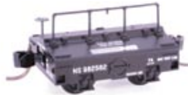
Scale Test Car Norfolk Southern • Rd# 982562 Item #12100020...$14.55

MKT, SP, UP, D&RGW, WP and MP are registered trademarks of the Union Pacific Railroad