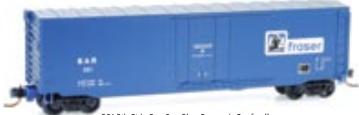
50' Rib Side Box Car, Plug Door w/o Roofwalk Bangor and Aroostock • Rd# 501 Item #03800390...$15.95