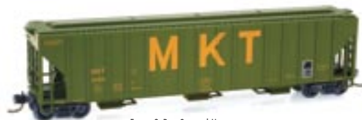
Evans 3-Bay Covered Hopper Missouri-Kansas-Texas • Rd# 4196 Item #09900011...$19.75