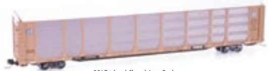
89' Tri-level Closed Auto Rack BNSF • Rd# 908425 Item #11100101...$39.95