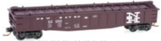
50' Steel Side, 15 Panel, Fixed End Gondola, Low Cover New Haven • Rd# 62008 Item #10600010...$15.15