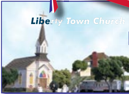
Liberty Town Church