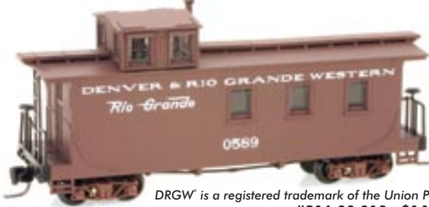
DRGW is a registered trademark of the Union Pacific #816 00 010...$14.65

This box car red caboose with two window cupola has white "Rio Grande" speed, white "Denver & Rio Grande Western" lettering and runs on brown Barber® Coleman Arch bar trucks. Built in the early 1900s by the Denver & Rio Grande railroad, this caboose was in use until the road shut down freight operations. There were only six road numbers from 0584-0589. Originally, all six had only one window in the side of the cupola, but in 1943, three of them had the cupola rebuilt to two side windows. These were 0584, 0587, and 0589. The others all kept the single window.