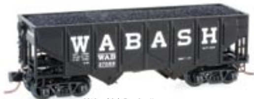
33' Panel Side Twin Bay Hopper Wabash with load • Rd# 37065 Item #08500010...$17.80