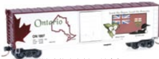
50' Standard Box Car, Single Door w/o Roofwalk Canadian: Ontario • Rd# 1867 Item #07700156...$18.25

MKT, SP, UP, D&RGW, WP and MP are registered trademarks of the Union Pacific Railroad