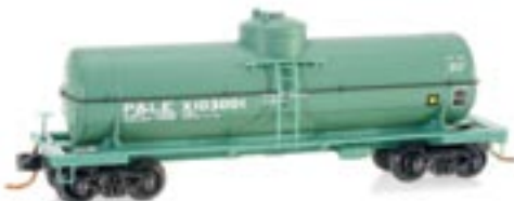
39' Single Dome Tank Car Pittsburg & Lake Erie • Rd# P&LE X103001 Item #065 00 570...$ 19.65