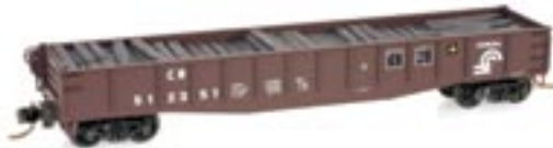
50' Gondola, Fishbelly Sides, Drop Ends w/ RR Tie Load Conrail • Rd# CR S12351 Item #046 00 320...$ 18.90