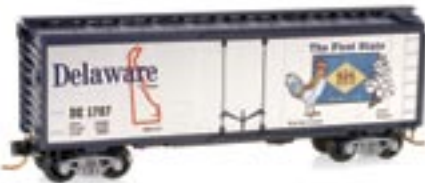
40' Standard Box Car, Plug Door Delaware State Car • Rd# DE 1787 Item #021 00 414...$ 19.85