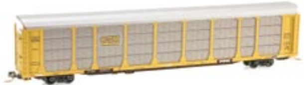
89' Tri-Level Closed Auto Rack CSX • Rd# TTGX 902071 Item #111 00 112...$ 36.90