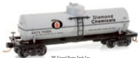
39' Single Dome Tank Car Diamond Chemicals • Rd# GATX 74350 Item #065 00 190...$ 19.95