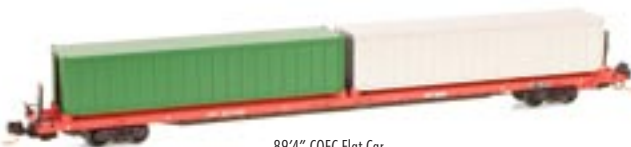
89'4" COFC Flat Car Canadian Pacific w/Containers • Rd# CP 521135 Item #072 00 230...$ 36.60