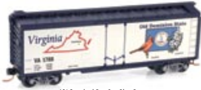
40' Standard Box Car, Plug Door Virginia State Car • Rd# VA 1788 Item #021 00 406...$ 19.85