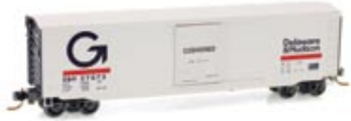
50' Standard Box Car, Single Door, w/o Roofwalk Delaware & Hudson • Rd# D&H 27073 Item #077 00 060...$ 18.80